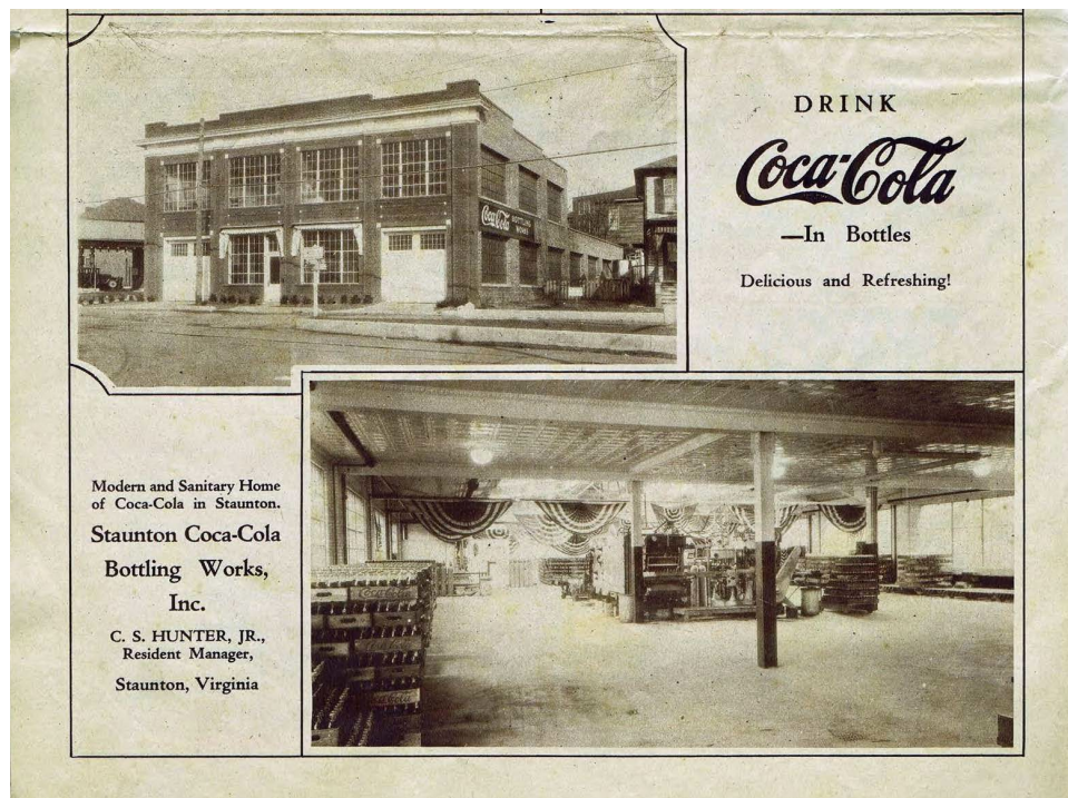
Newspaper Advertisement, unknown date – From Historic Staunton Foundation

The plant was enlarged in 1953 with the construction of a brick and concrete garage at the rear end of the original building (Permit for... The Daily News Leader 23 June 1952). More work to the plant was undertaken in the 1960s to expand and modernize the facility. Part of this included a new façade for the plant involving a tile mosaic including one of the building's primary product: a Coca Cola bottle.