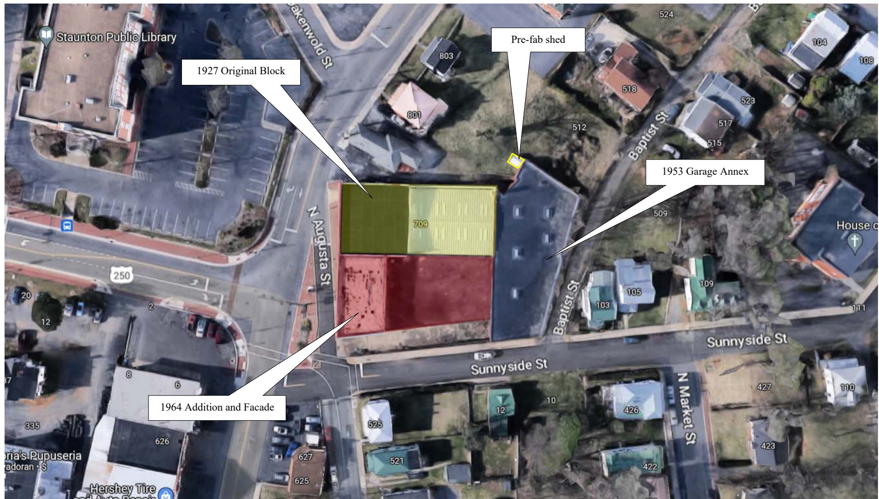
Staunton Coca Cola Bottling Works, 709 North Augusta Street – Sketch Map, Google Maps 2023