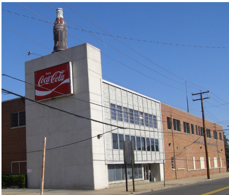
Roseneath Road Coca Cola Building