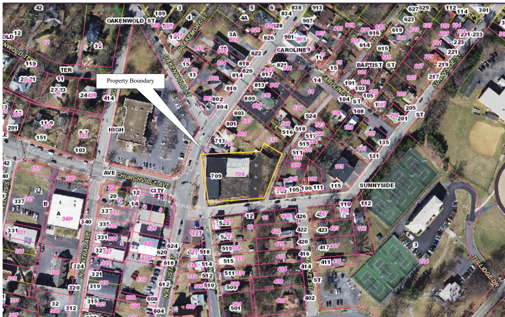
Staunton Coca Cola Bottling Works, 709 North Augusta Street – Location Map, City of Staunton Parcel Data Viewer