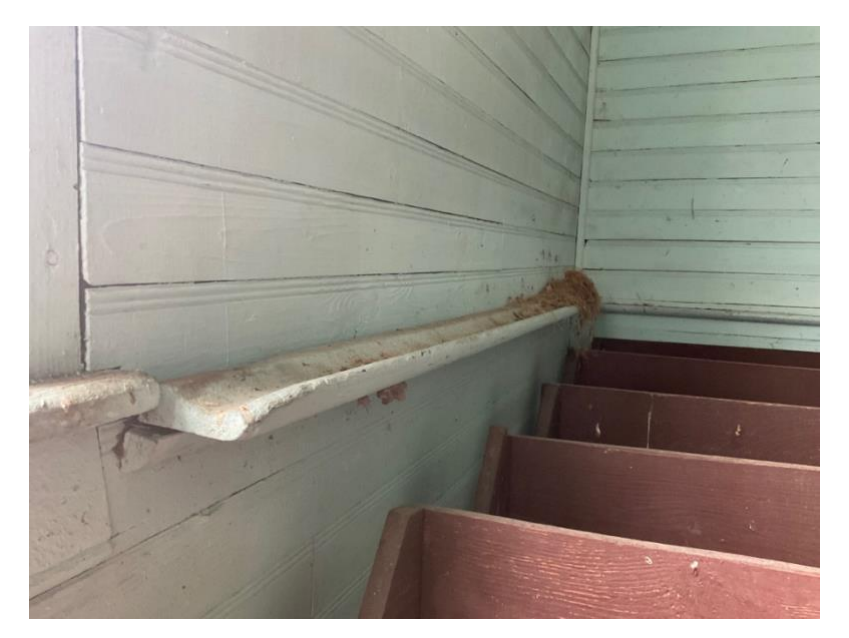
CHALK TRAY ON WEST WALL IN WEST CLASSROOM