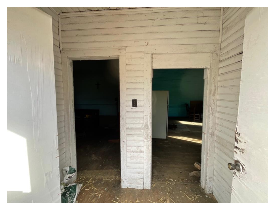
VESTIBULE, FACING NORTH TOWARDS CLASSROOM DOORS