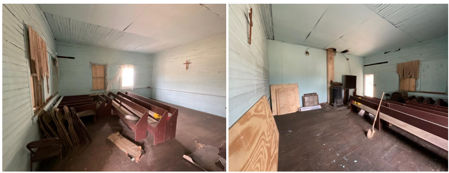
WEST CLASSROOM, FACING NORTHWEST