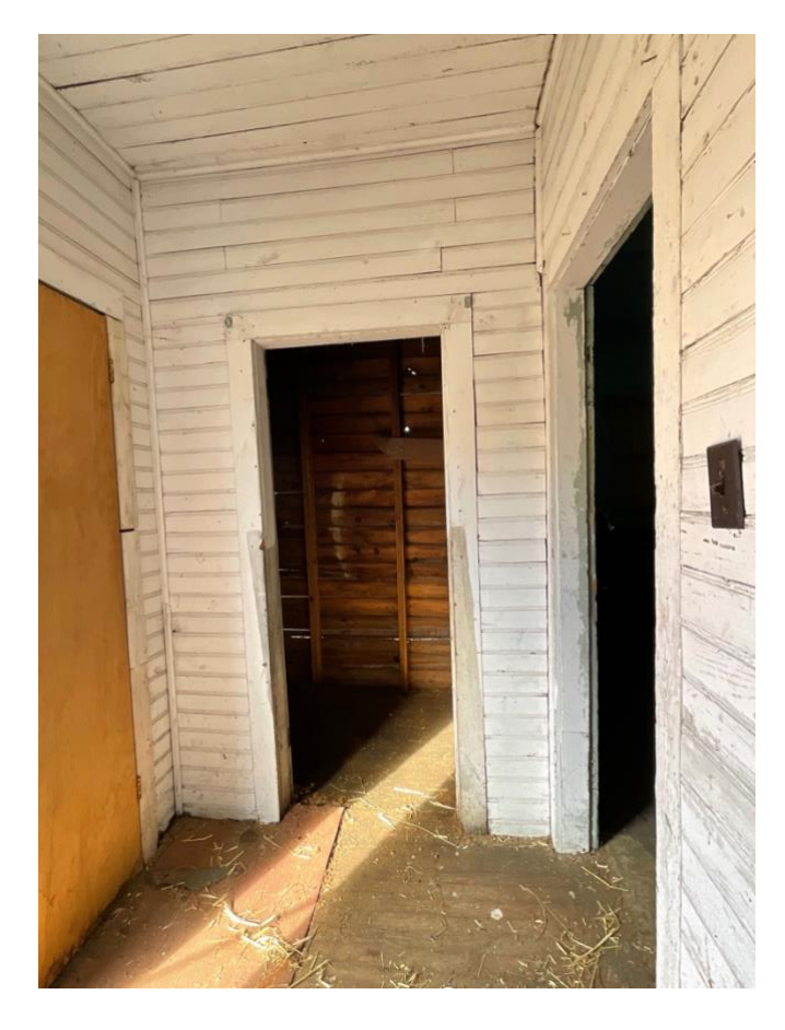
VESTIBULE, FACING WEST TOWARD CLOAKROOM