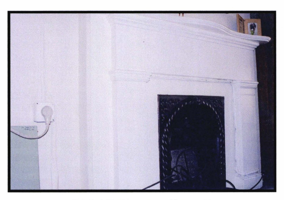
Plate 7. Adkins House, second floor mantel.