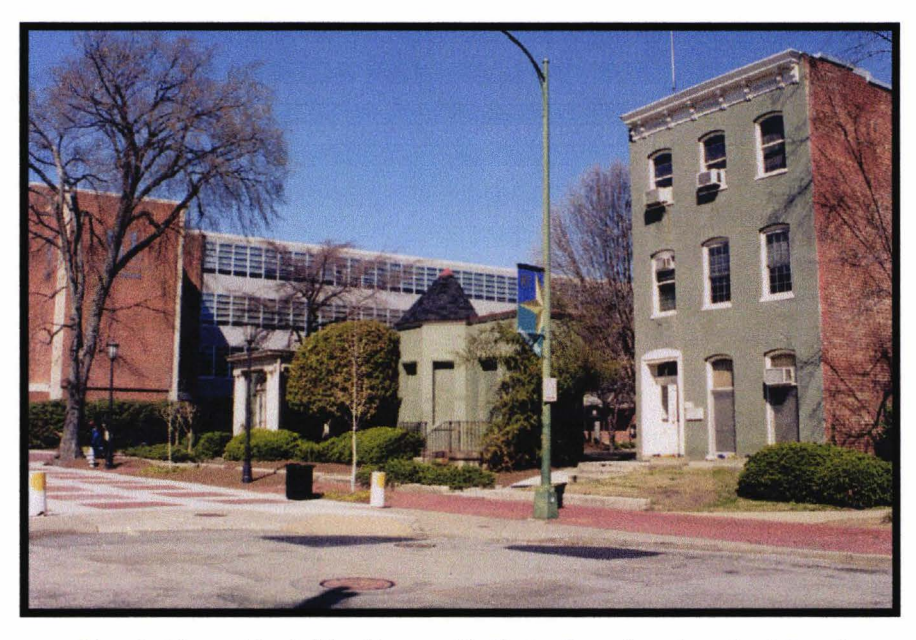
Plate 3. View of the Adkins House with Shafer Court facade to the left and Hibbs Building in the background, view to the northwest.