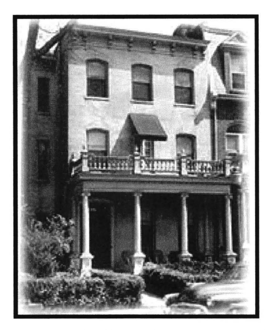
Plate 1. Historic photograph of Adkins House showing original front porch.