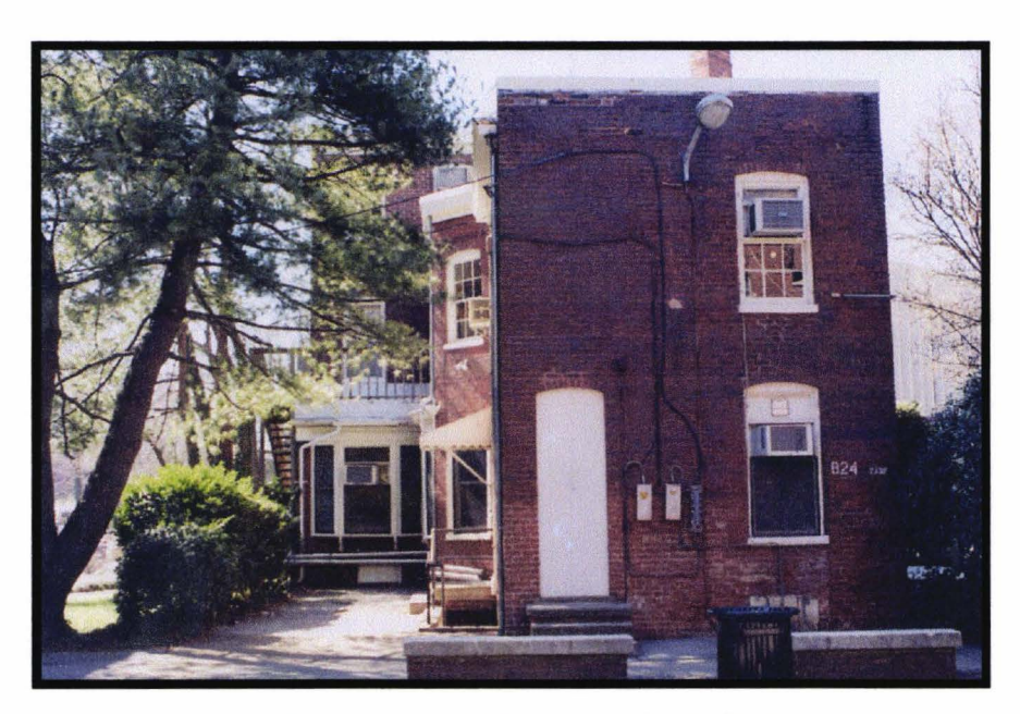
Plate 5. Adkins House, rear, view to the southwest.