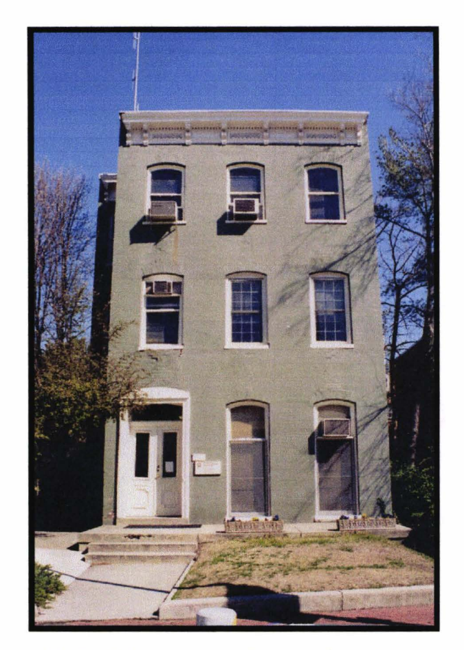
Plate 4. Adkins House facade, view to the northeast.