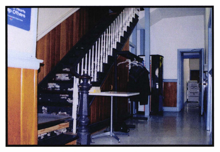
Plate 6. Adkins House, first floor hallway and stairs.