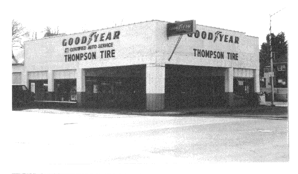
Plate 6 Concrete Block Commercial Building 126-0089