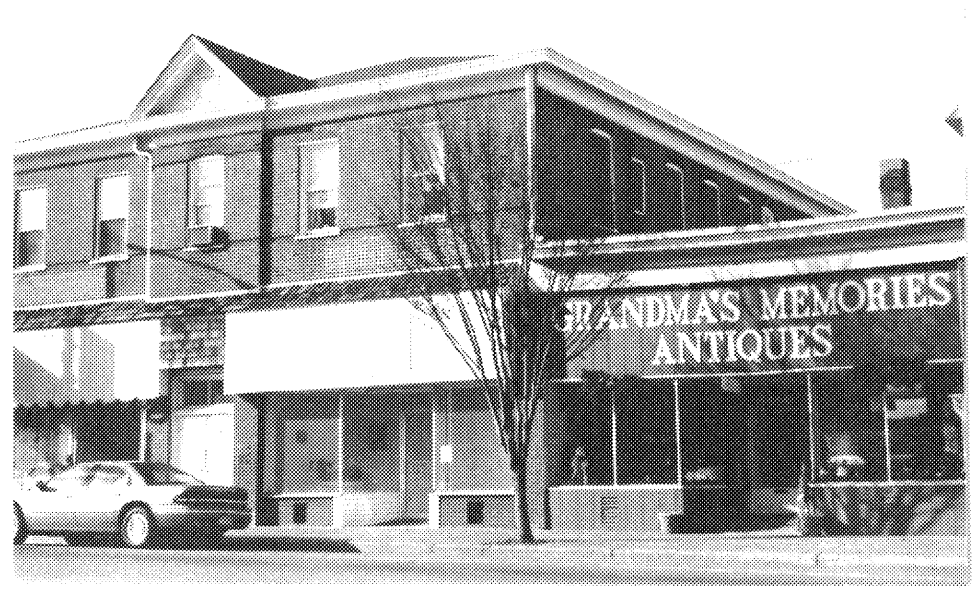
Plate 2 Randolph building 126-0050 Second-floor corridor