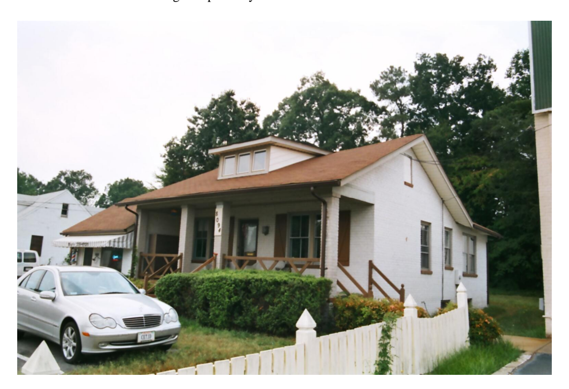
Plate 3. This is a good example of a brick Bungalow-style dwelling in Mechanicsville.