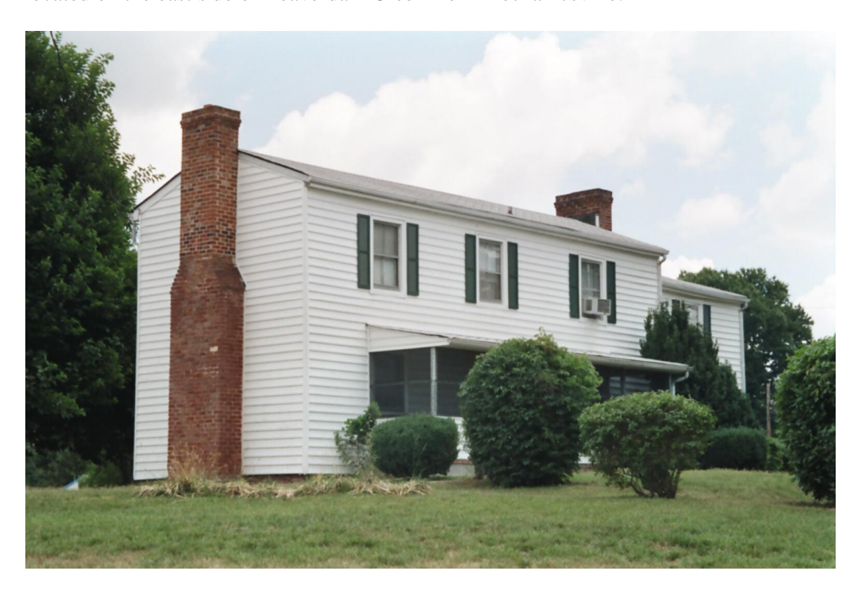
Plate 13. Berkley House on Fullview Avenue.

Luck also developed the area between Atlee Road and Shady Grove Road in the later 1940s after he began Hanover Farms. The farmhouse for this land is still standing (Plate 13). This is one of the earliest houses that survives in the immediate area and was probably constructed between 1880 and 1900. It is a single-pile, central-passage plan house with two exterior-end brick chimneys laid mostly in five-course American bond. It has a major addition on the east end. This was a typical house type found on farms through the eastern half of the county from the late eighteenth century through the early twentieth century. The house was purchased in 1947 by the Berkley Family and previously had been owned by the Bruce family who purchased Walnut Lane that was located on the east side of Beaverdam Creek from Mechanicsville.<sup>9</sup>