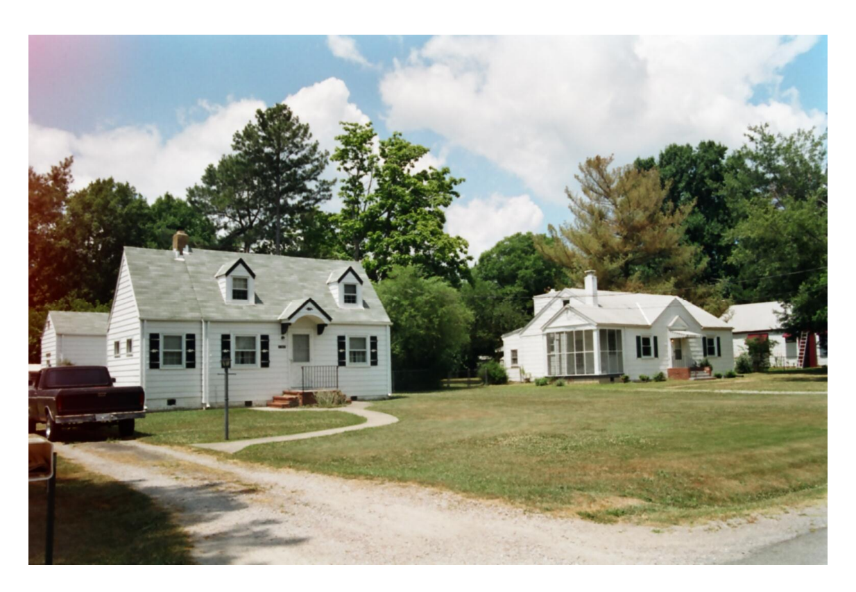
Plate 12. Houses on Pickett Avenue in Hanover Farms.

At about the same time Virginia Manor was being developed or shortly afterward, Buford Luck developed Hanover Farms. The area on the west or Richmond side of Atlee Road along Signal Hill, Luck, Picket, and Strain avenues is known as Hanover Farms. In this area Luck built small, one and one-and-a half story, frame dwellings. These houses on Pickett are typical of Hanover Farms (Plate 12). As noted earlier, the great majority of these houses do not have front porches but small stoops topped with a gable hood or pediment. The house on the right has a front pediment creating a cross gable roof while the house on the left has two gable dormers.