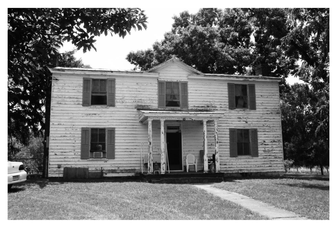
Plate 1. Fairview (042-5162)