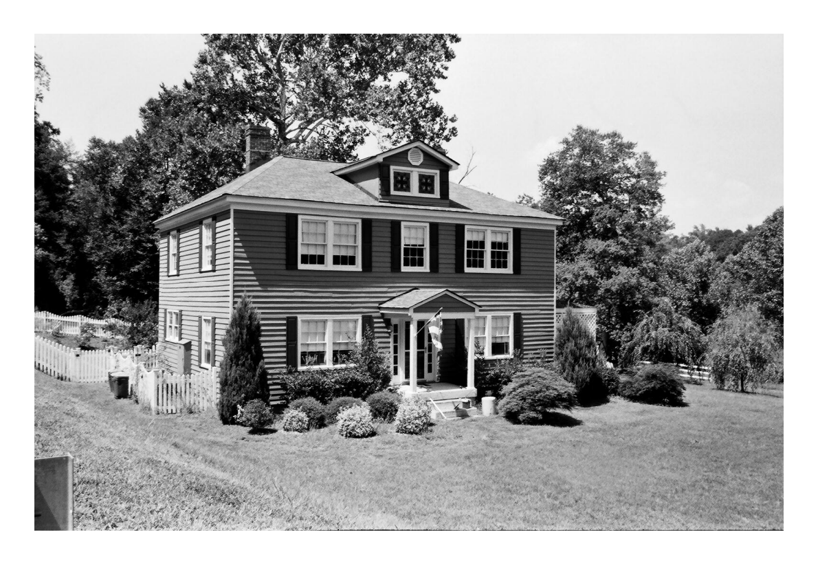
Plate 18. Millerøs House (042-5277)