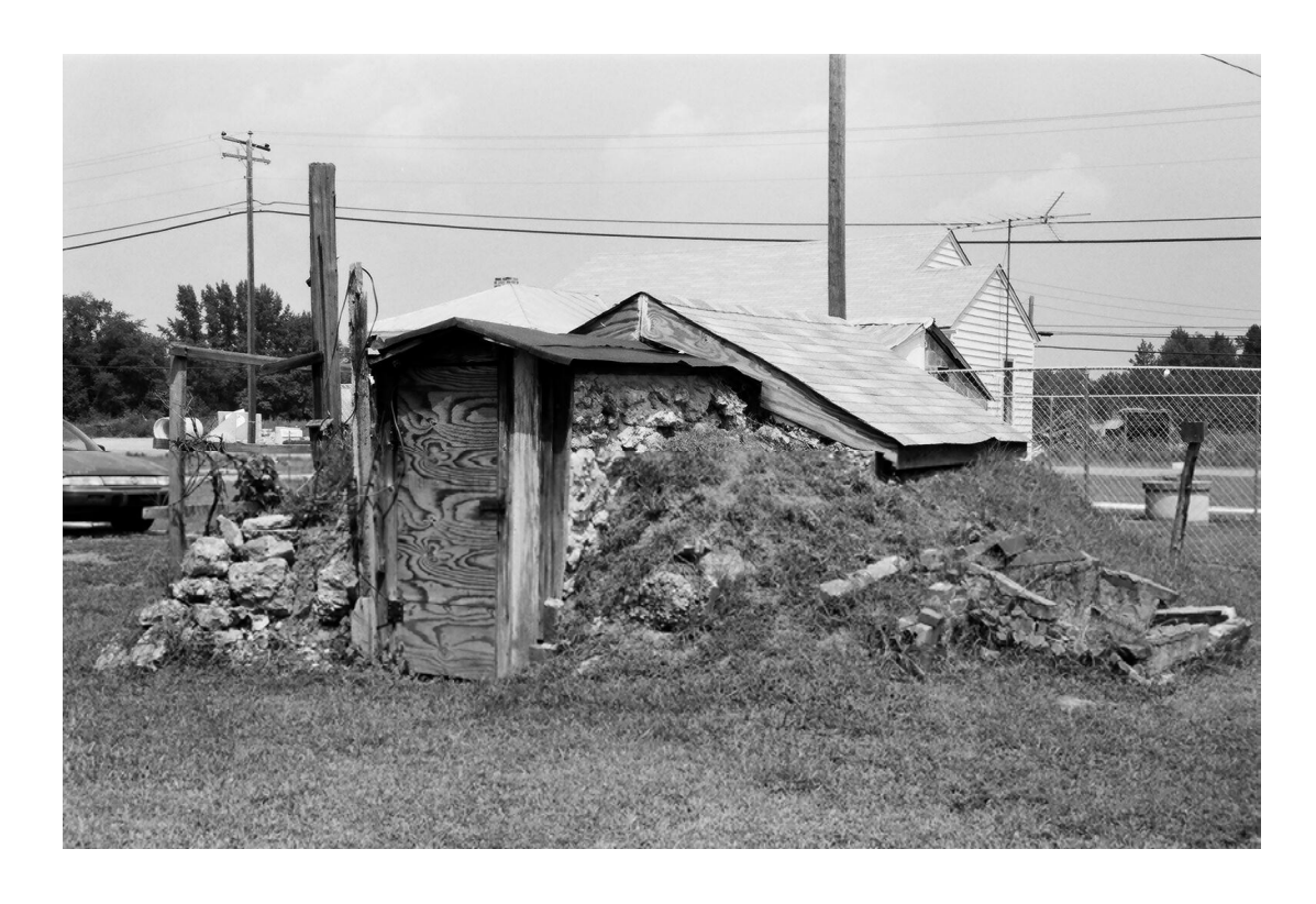
Plate 13. Robinson Farm Potato House (042-5213)