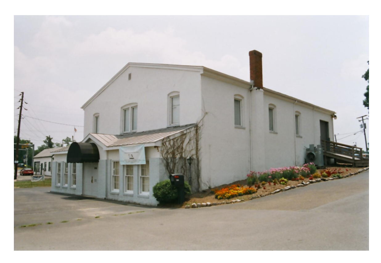
Plate 4. West Funeral Home, located on Atlee Road.