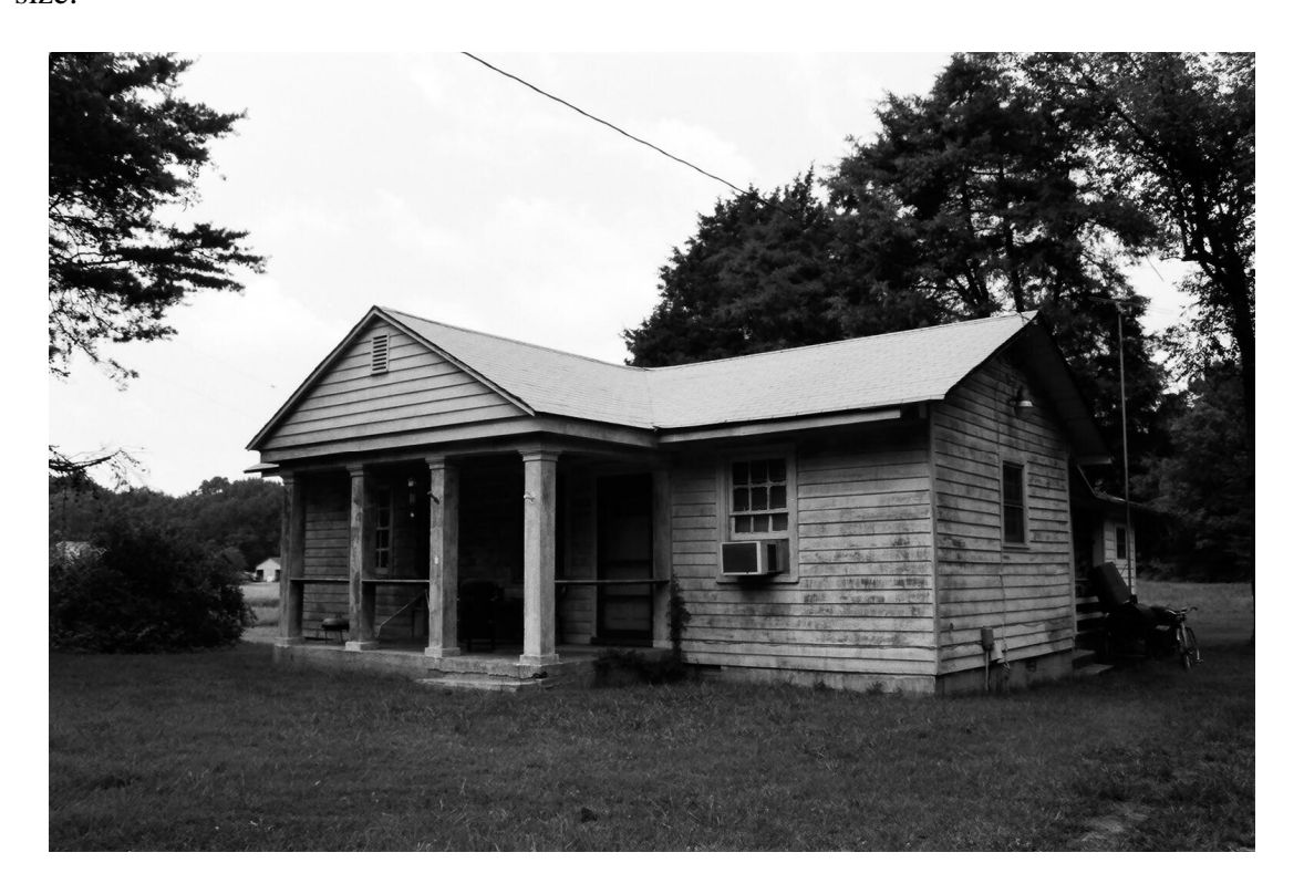
Plate 3. House (042-5164)

The house at 10264 Old Ridge Road (042-5164) is an interesting example of a smaller, early-twentieth-century house built in this area dominated by two-story farmhouses (Plate 3). Perhaps it was a tenant house. It is one story, frame, sheathed with weatherboard with a cross-gable roof. Its defining feature is the three-bay front porch with well-proportioned porch pillars. This handsome porch is somewhat unusual on a house this size.