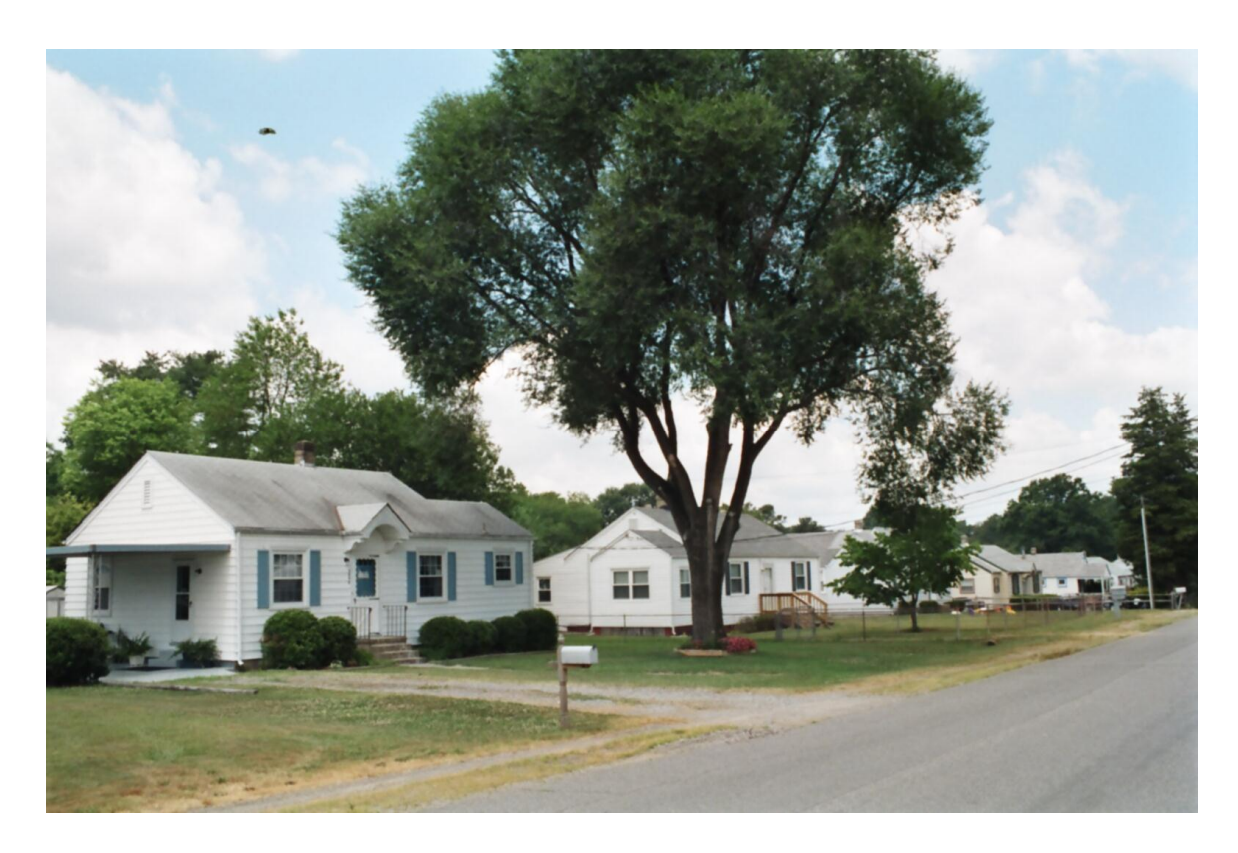
Plate 14. Frame houses on Roosevelt Avenue.