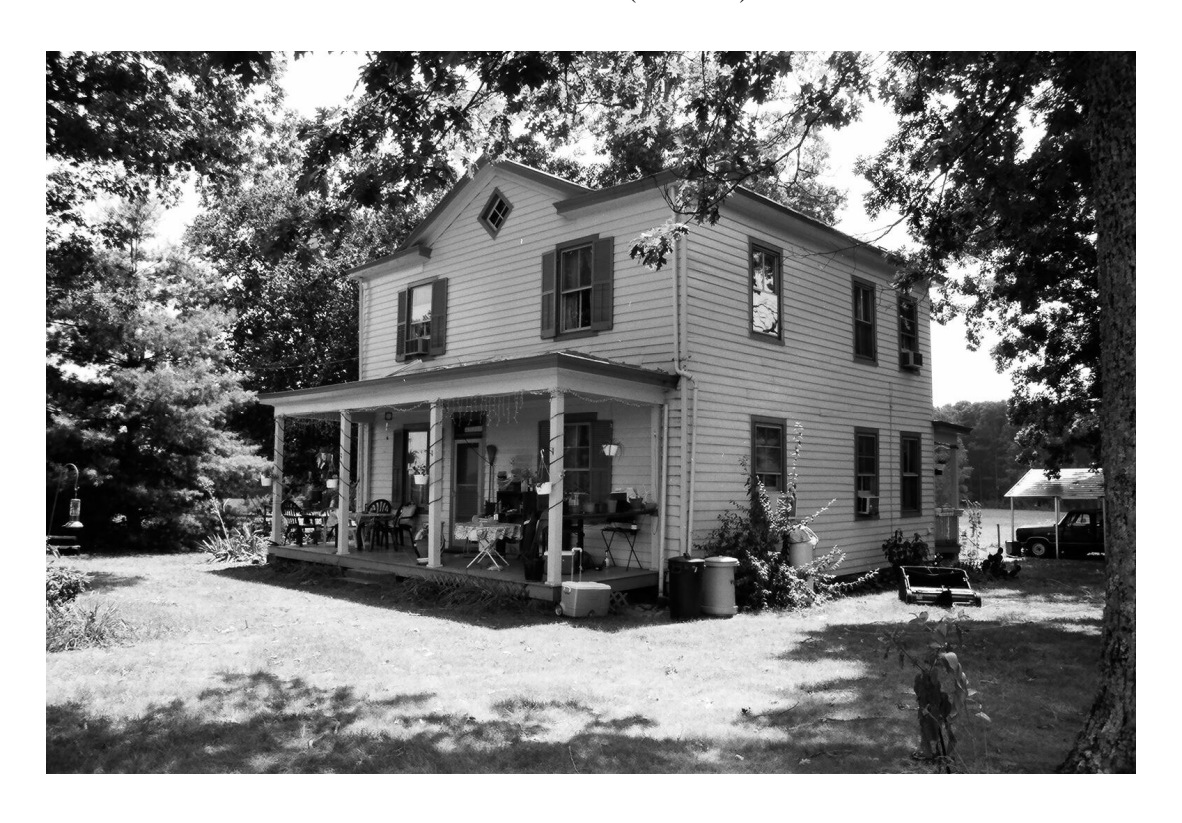
Plate 2. House, Old Ridge Road (042-5165)