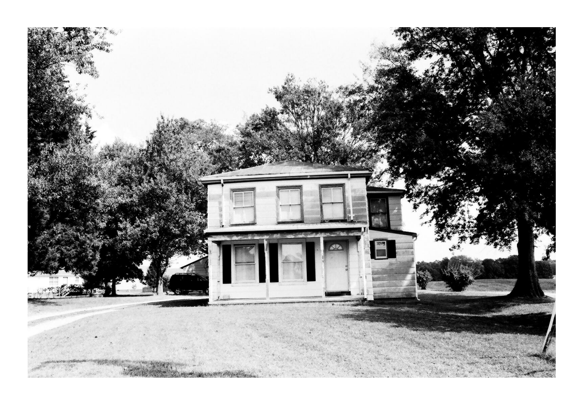
Plate 5. Agee Farm (042-5290)