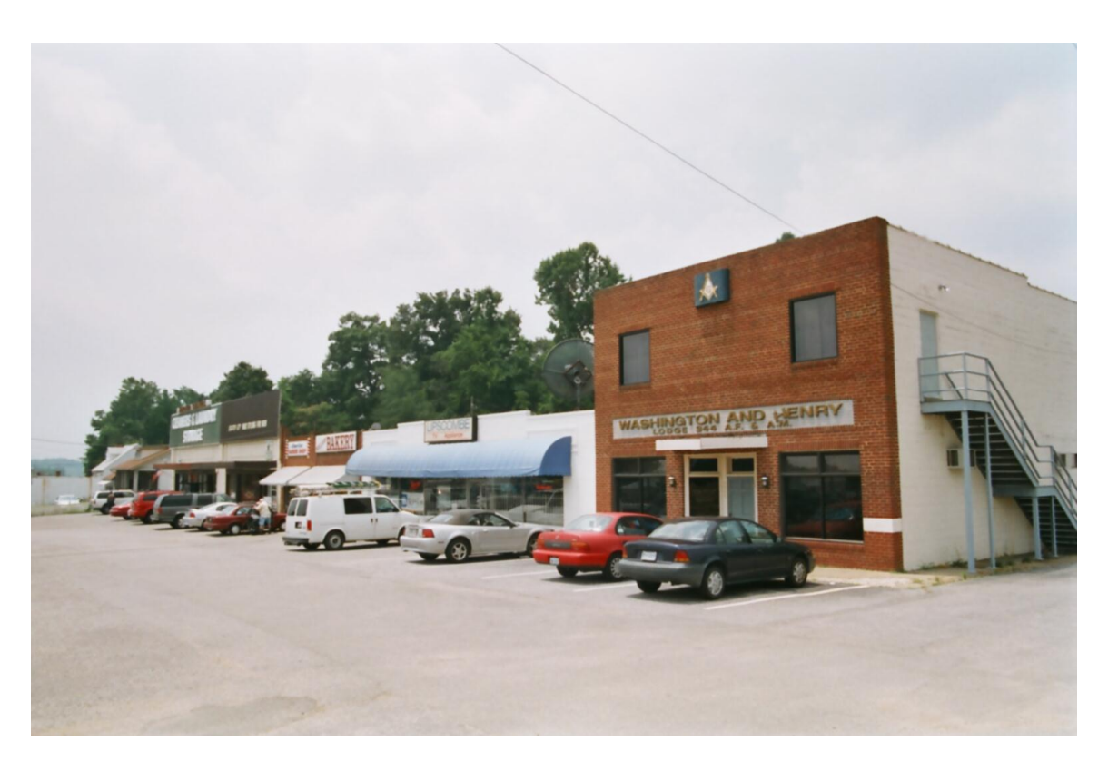
Plate 7. Commercial block in Mechanicsville with Washington and Henry Lodge on the north end.