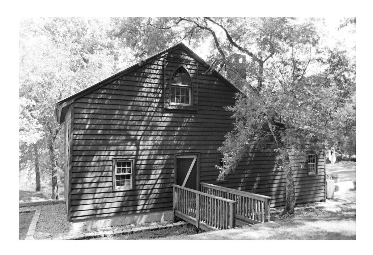
Plate 17. Flannaganøs Mill (042-5276)