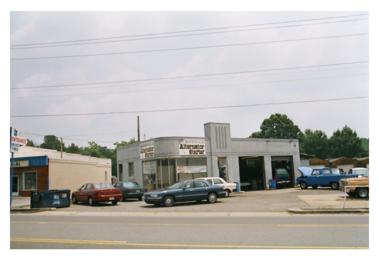
Plate 9. Former service station located on southeast side of Mechanicsville Turnpike.

Fewer early commercial buildings survive on the southeast side of Mechanicsville Turnpike. Several dwellings from the 1930s and/or 1940s remain on this side of the highway from the period before commercial expansion along Mechanicsville Turnpike. Two service stations that were probably built in the early 1950s are located on this side (Plate 9). The most intact has two garage bays on one side of a central entry with large glass windows and curved corner on the opposite end. Four parallel strips of glass blocks highlight a tower above the entry. Service stations, or filing stations as they were also known, with this same architectural design once dotted the country. The other early service station has been altered losing much of its architectural integrity. The Loving Produce Stand is also located on this side of the highway. Simply an open pole shed, the stand reflects the continued presence of agricultural in Hanover County.