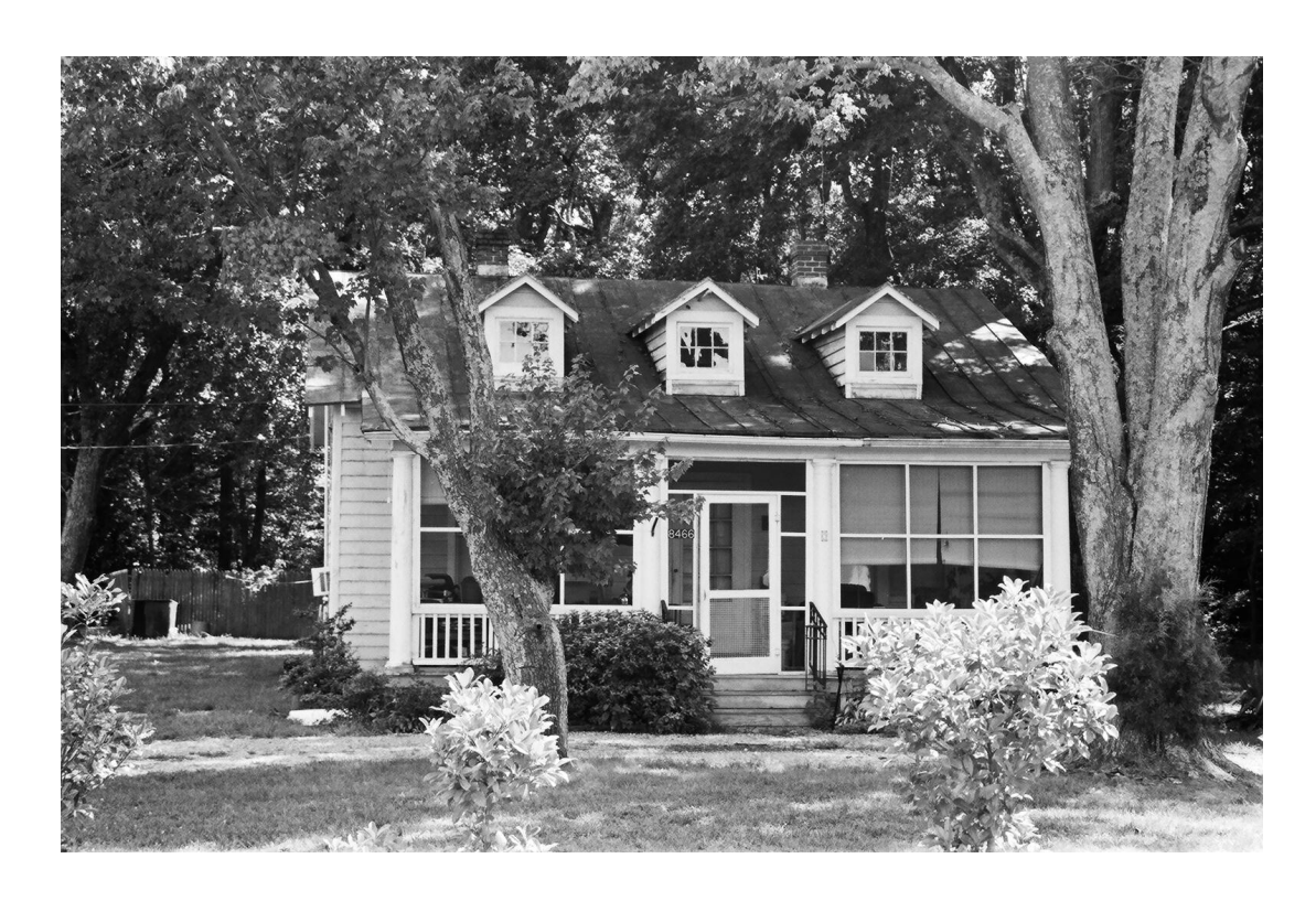
Plate 11. Small Bungalow (042-5264)