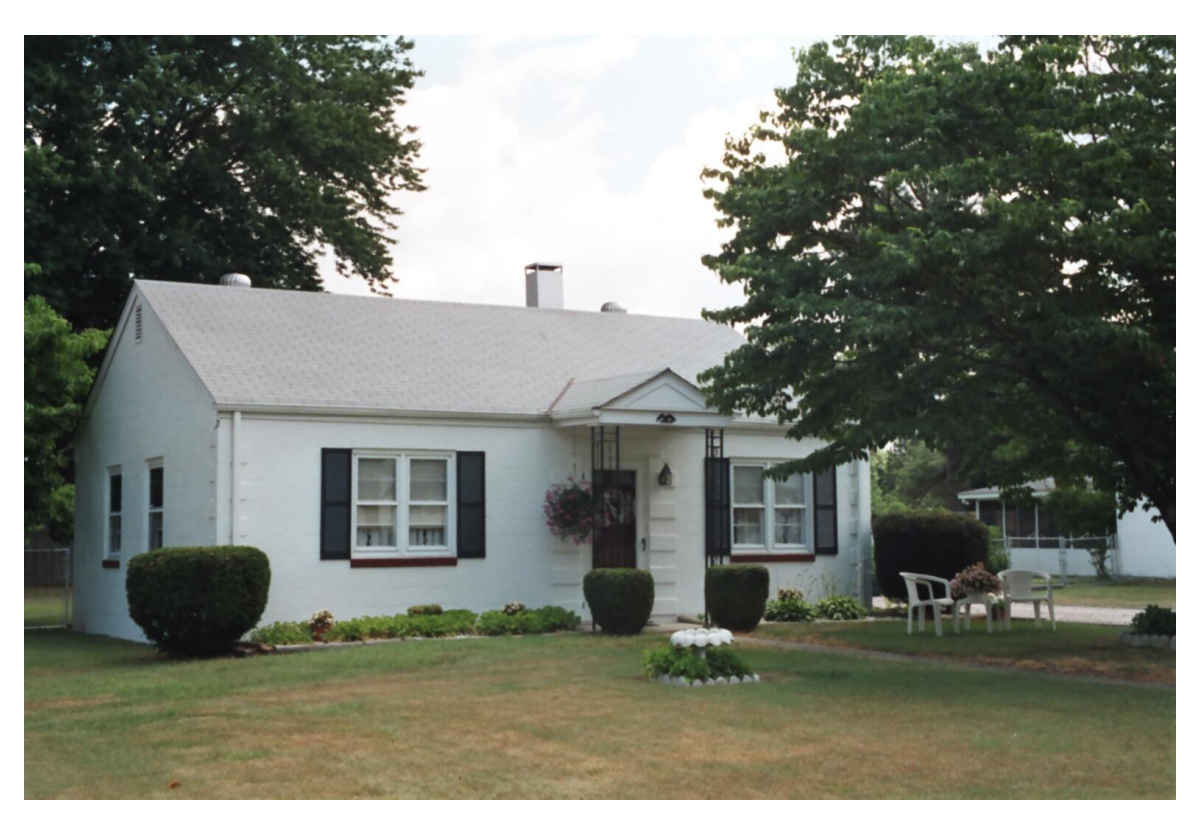
Plate 15. Concrete-block with raised quoins, three-bay façade.