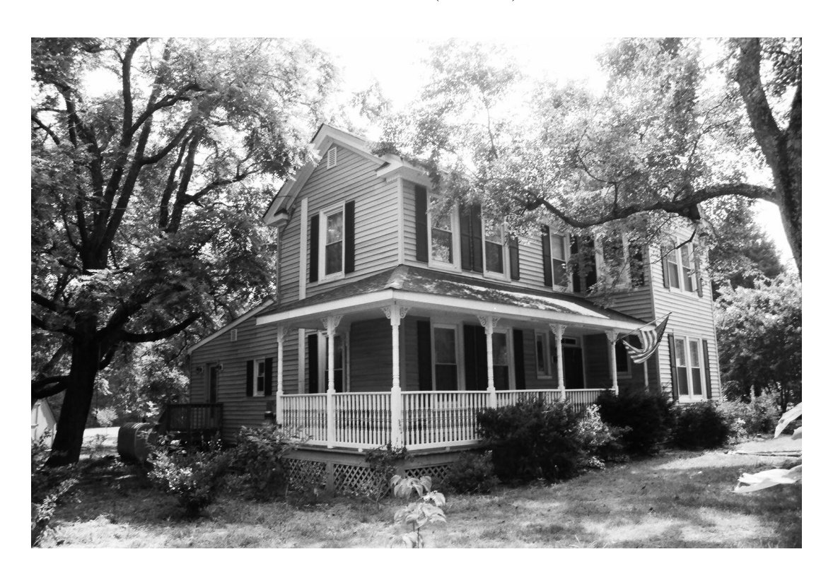
Plate 10. Franck House (042-5227)