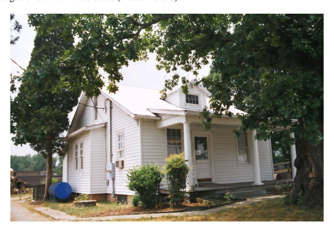
Plate 1. This white frame dwelling was probably built some time in the 1920s or 1930s.

The use of round porch columns is more likely to be found on houses of this period than later dwellings. These houses in Mechanicsville are generally frame, one-story, with a side gable roof with wide eaves (Plates 2 and 3).