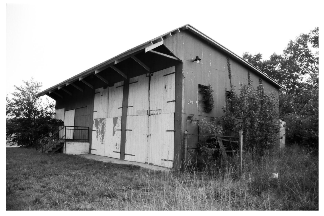
Plate 16. Resource 042-5222

Two metal warehouse-type buildings were documented on Route 1. Resource 042-5221 is a tall, one-story, gable-roof building sheathed with corrugated metal with a shed extension along one side. Resource 042-5222 is also sheathed with corrugated metal with a pent overhang on the side that faces Route 1 (Plate 16). It has two double-leaf loading doors and a concrete loading dock on one end of the façade. Both of these buildings are currently vacant but are typical of industrial buildings once found along Route 1.