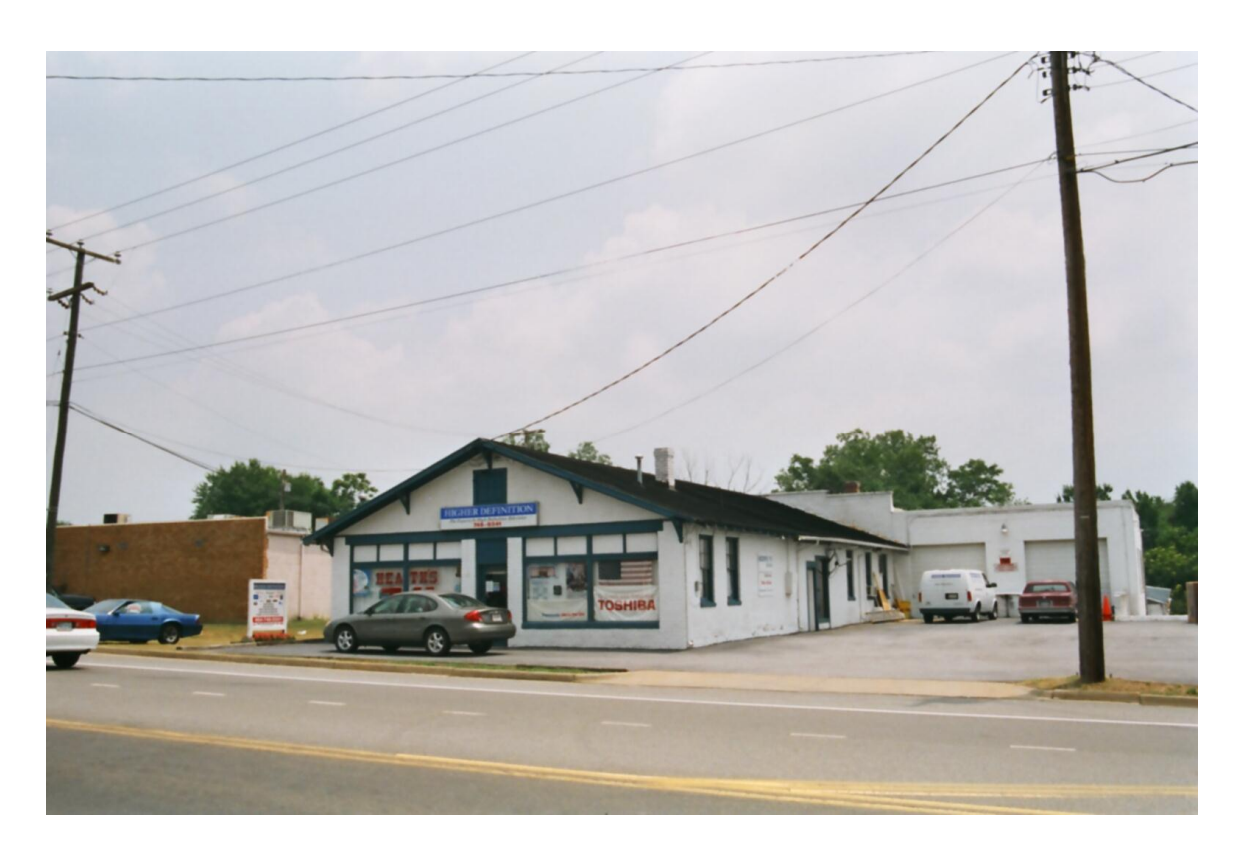
Plate 6. The former Mechanicsville Motor Company now Heathøs TV.

eaves and a ribbon of transoms above the large storefront windows. This building has the most original storefront in Mechanicsville. The concrete-block section was added to the rear in 1947 by Baldwin Construction Company.<sup>6</sup>