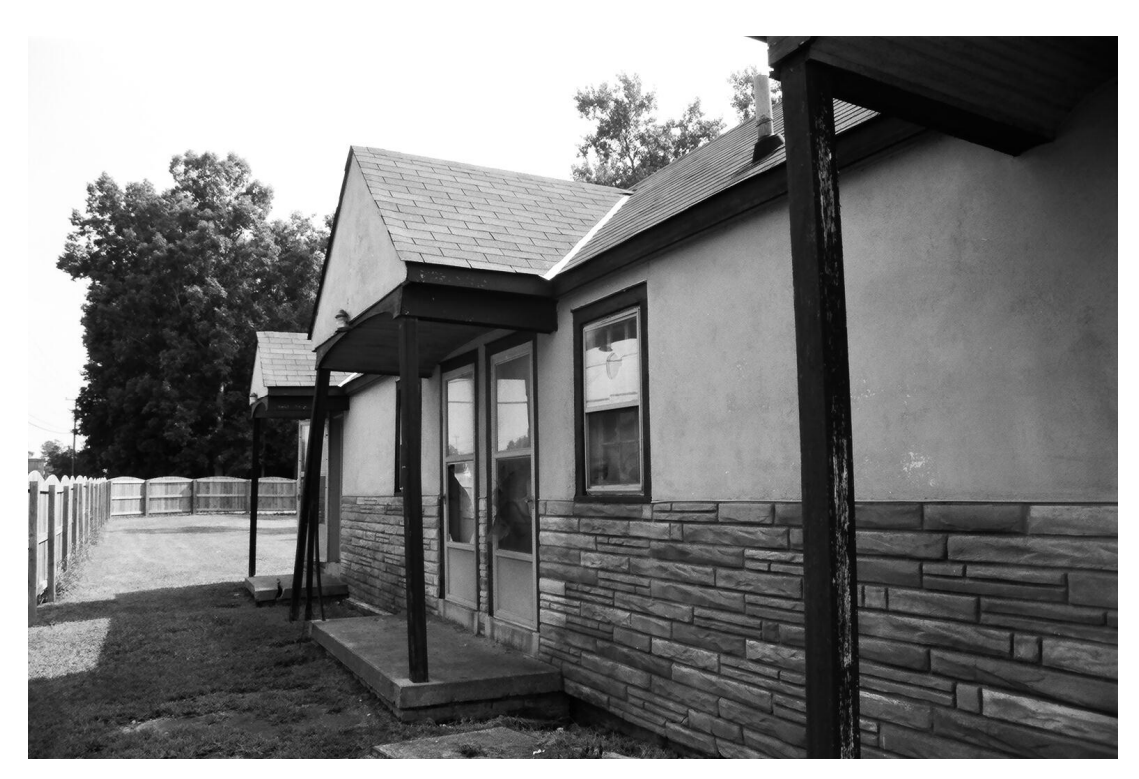
Plate 15. Motel Unit (042-5219)

now vacant and endangered. The remaining motel unit at Kosmo Village (042-5219) was surveyed (Plate 15). At one time part of the Duck Inn Truck Stop and also known as City Center Motel (and odd choice of name for what was then a rural area) only the main office/truck stop building and four motel rooms in one building survive. The main building is a large two-and-a-half story building covered with smooth plaster. The former large storefront windows have been covered with paneling. The motel rooms are in one unit ó a one-story, plastered building on a brick foundation with a Permastone wainscot on the façade. Each room has a one-bay, gable roof front porch on a concrete stoop except for the middle two rooms that share a porch. Shed roof sections on the rear housed the bathrooms. These units have long been vacant and according to the owner will soon be demolished.