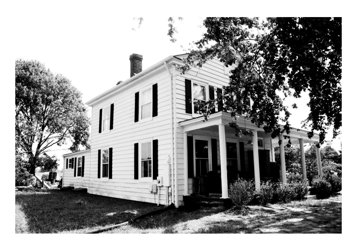
Plate 6. Meredith Farms House (042-5289)