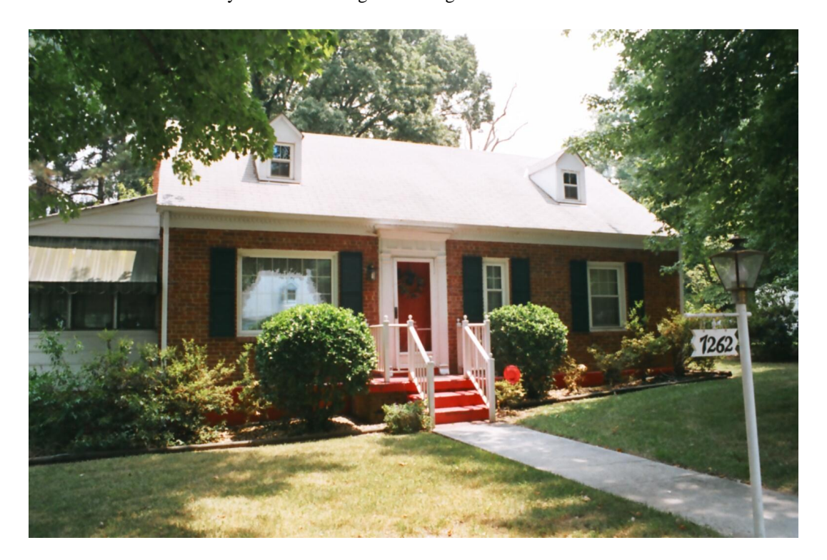
Plate 11. This house retains most of its original details and has a finely detailed front door surround.