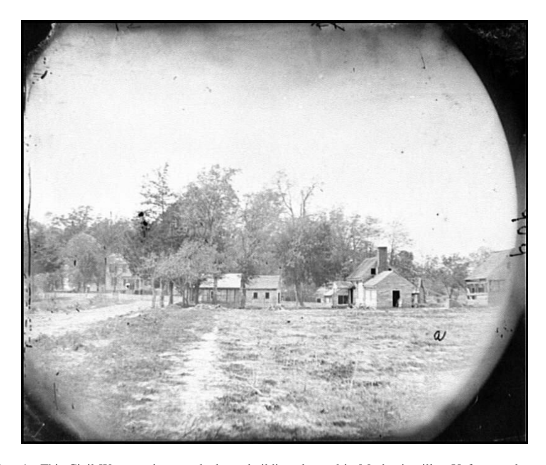
Plate 1. This Civil War-era photograph shows buildings located in Mechanicsville. Unfortunately, none survive today. The Lumpkin House is located on the far left.