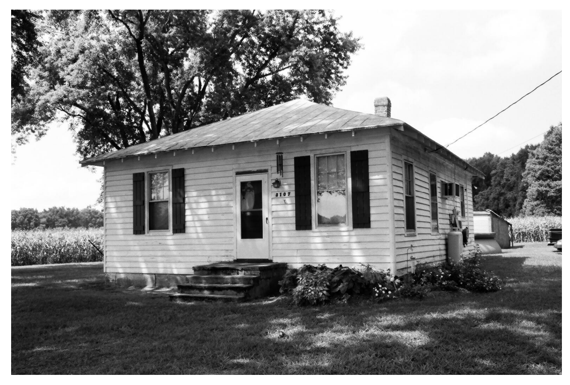
Plate 4. House (042-5256)

front. The house on Lee Davis Road is similar with a hip roof with two interior chimneys flues. This house has lost its porch.