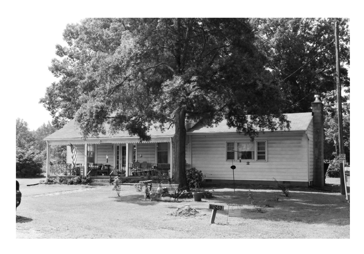
Plate 7 Railroad House (042-5202)