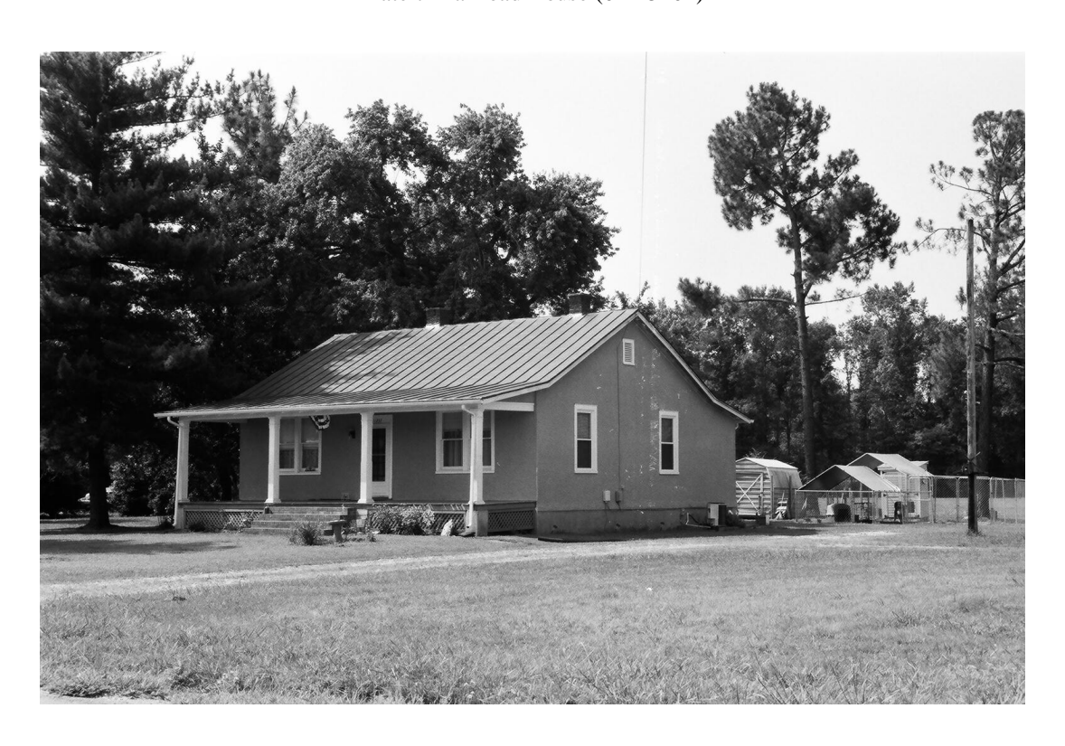
Plate 8. House (042-5200)