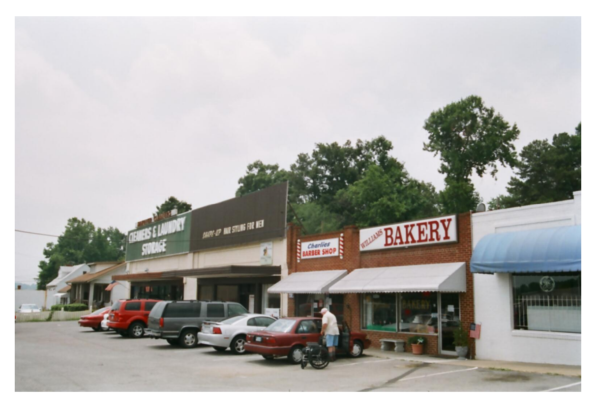
Plate 8. Most original commercial block in Mechanicsville.