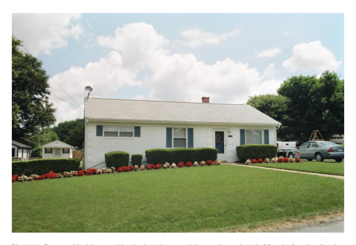
Plate 16. Concrete-block house with raised quoins around door and at each end of façade, four-bay facade.

Mechanicsville has a wealth of immediate post-World War II architecture that is an overlooked resource. It is one of the few areas in the county that has a good stock of small houses. Although these houses are small, they are well detailed with decorative features that produce a cohesive and in some cases classic appearance. While there is a much smaller stock of commercial buildings that survive from the early to mid-twentieth century, those that do survive contribute to the sense that Mechanicsville is a community.