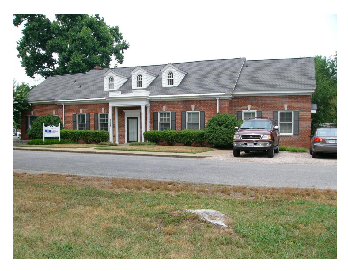
Plate 10. Colonial Revival-style office building in the Virginia Manor area.