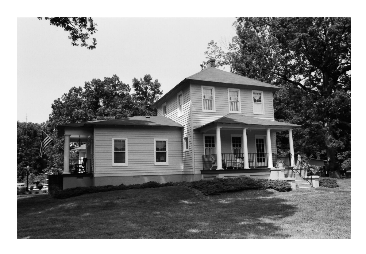
Plate 9. House (042-5204)