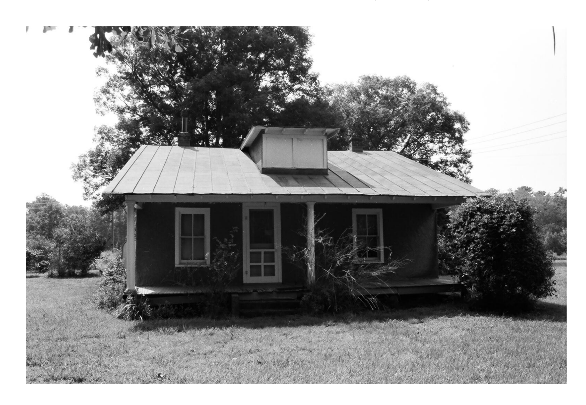
Plate 14. Robinson House (042-5214)